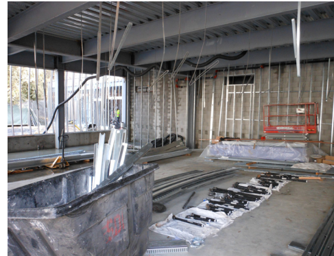
New Exercise Physiology Lab/ Classroom