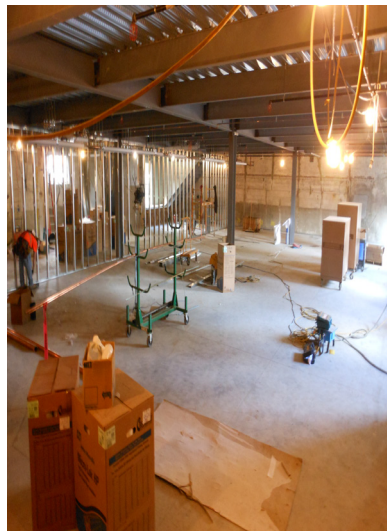
Renovated Weight Training Room