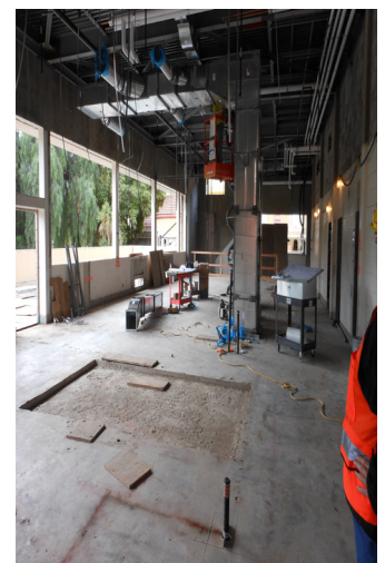
Stress Management Room