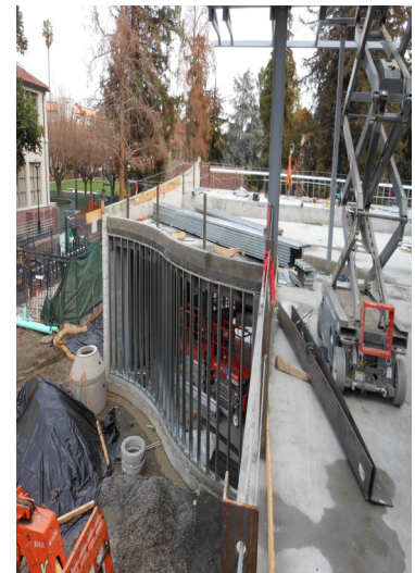
View of the Roof Garden