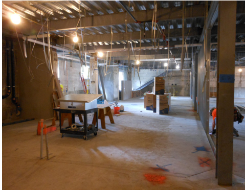
New Athletic Training Lab