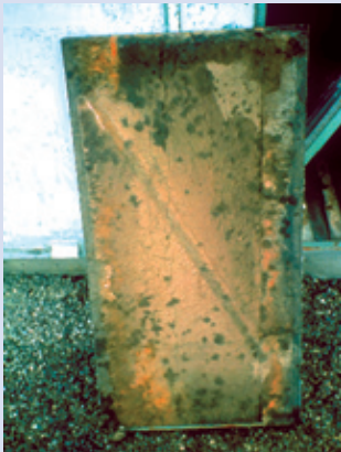
Photo 4A: Contaminated fibrous insulation inside air handler cover

Do not run the HVAC system if you know or suspect that it is contaminated with mold. If you suspect that it may be contaminated (it is part of an identified moisture problem, for instance, or there is mold growth near the intake to the system), consult EPA's guide Should You Have the Air Ducts in Your Home Cleaned? 4 before taking further action (see Resources List).